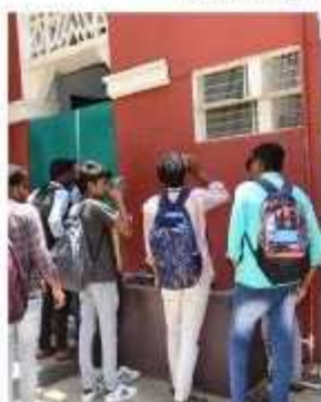
RO Drinking Water