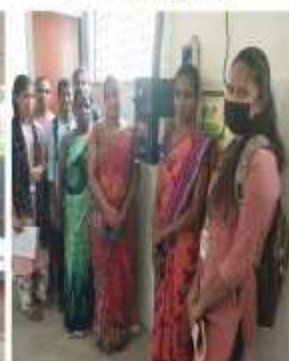
Napkin vending and Incinerator