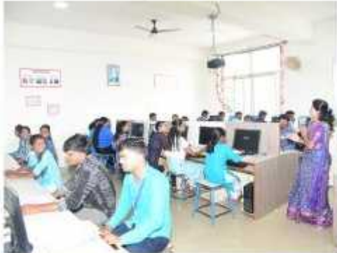
Computer Lab with solar backup