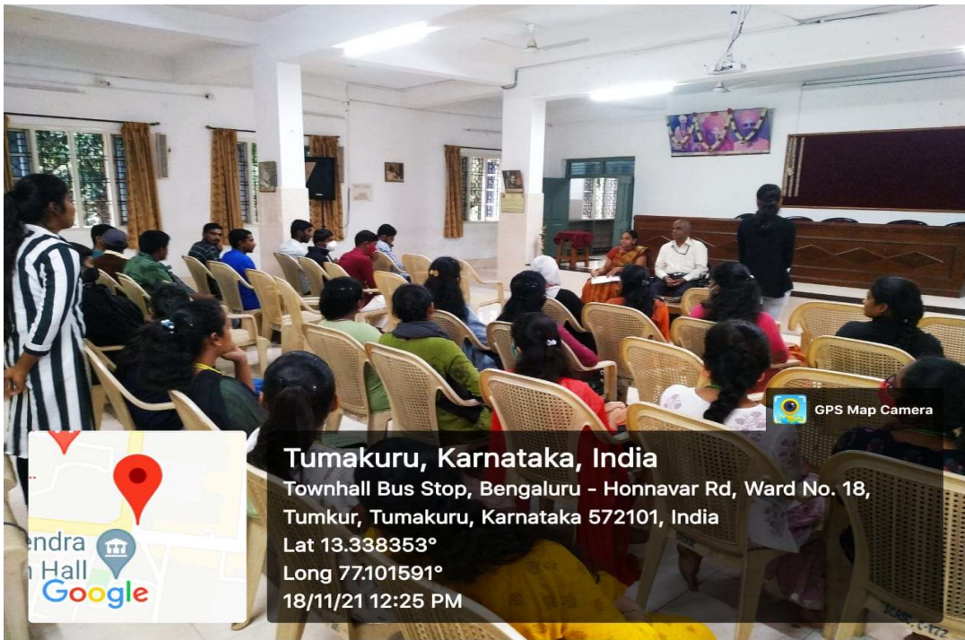
CR Meeting on 18-11-21