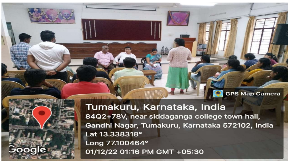
CR Meeting on 01-12-2022