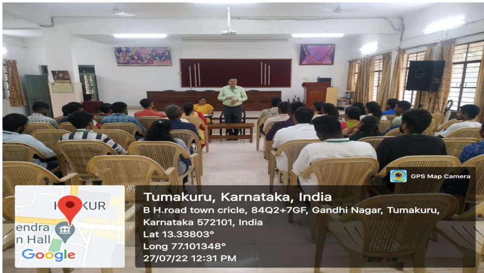
CR Meeting on 27-7-2022