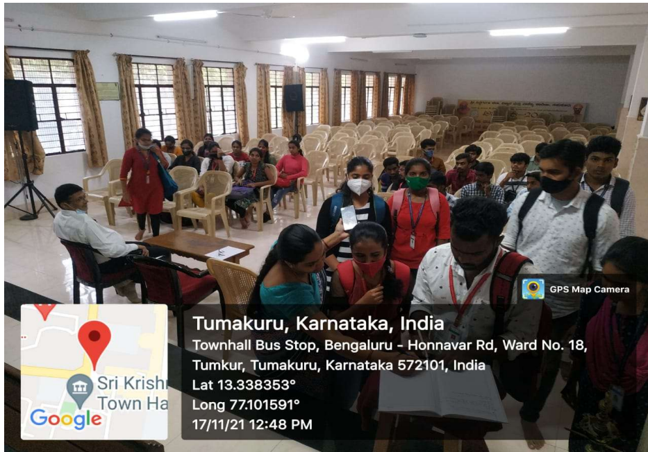
CR Meeting on 17-11-21