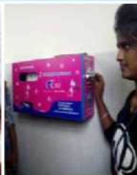
Napkin vending and destroyer