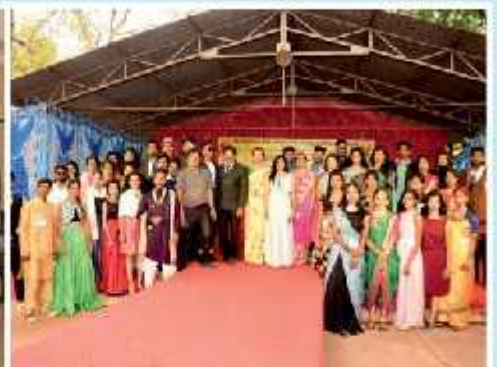
Open air theatre