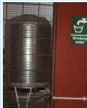
RO Drinking Water