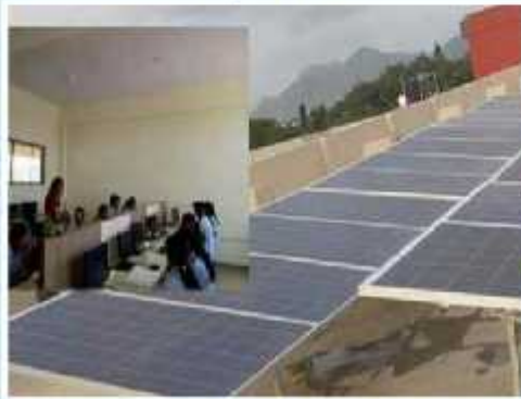
Computer Lab with solar backup