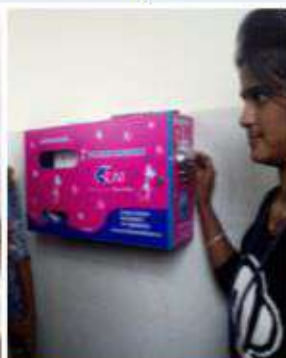
Napkin vending and destroyer