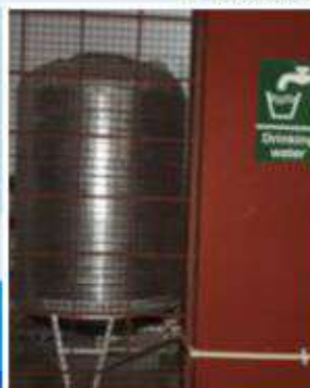
RO Drinking Water