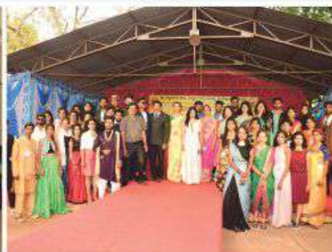
Open air theatre