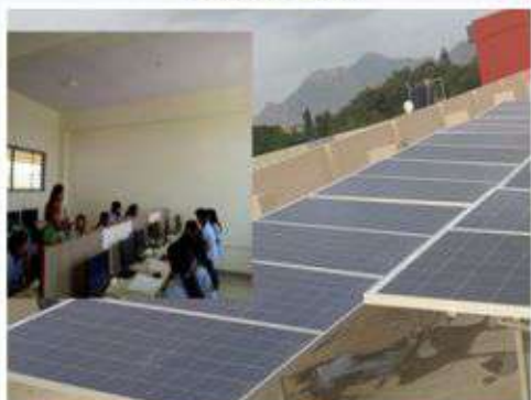
Computer Lab with solar backup