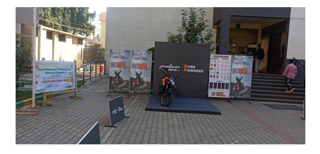
Ride Awareness Program