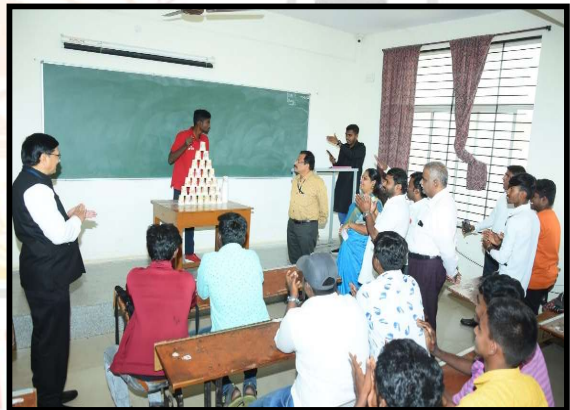
Psychic game for the students