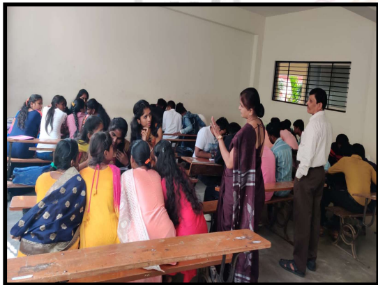
Ice breaking Activity for the students