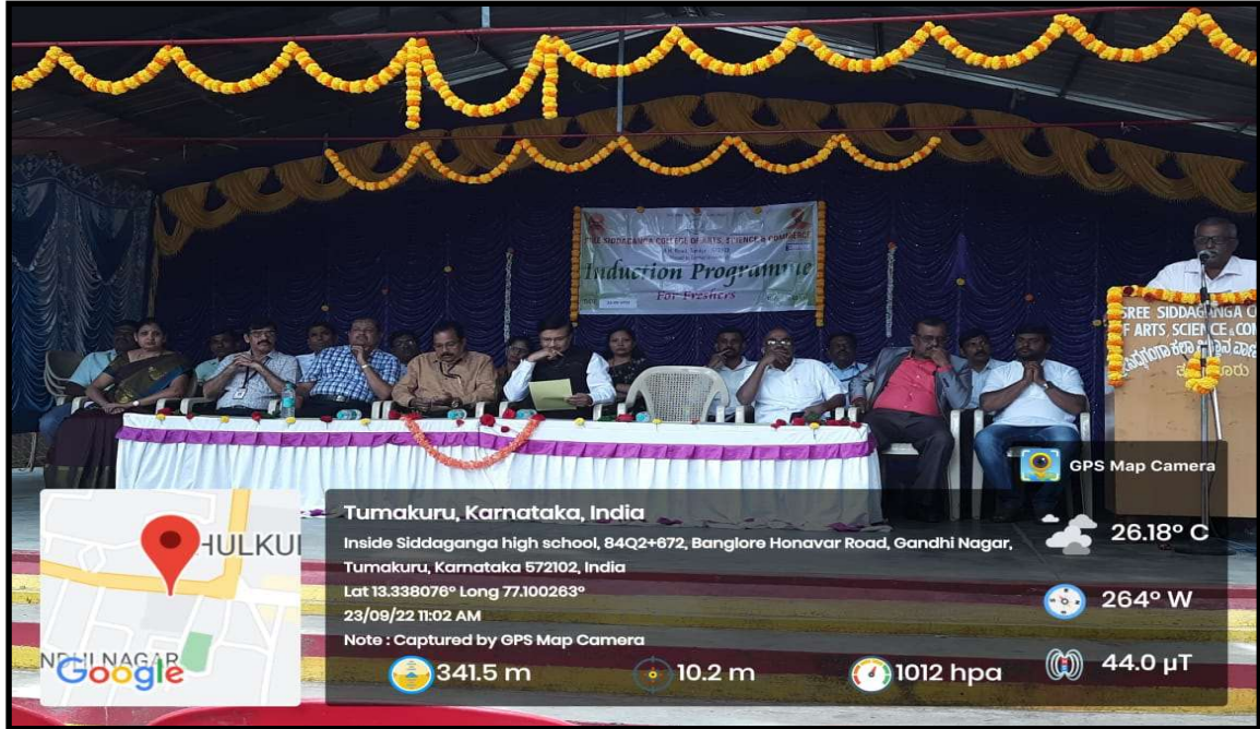
Inauguration of the program