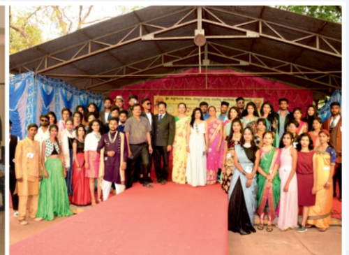
Open air theatre