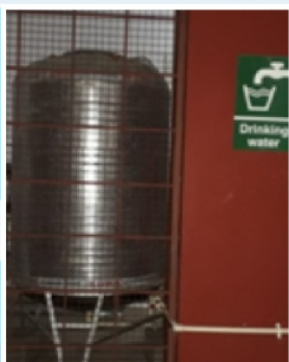
RO Drinking Water