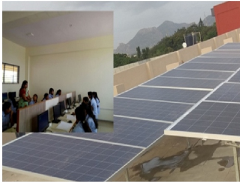
Computer Lab with solar backup