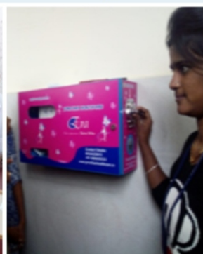
Napkin vending and destroyer