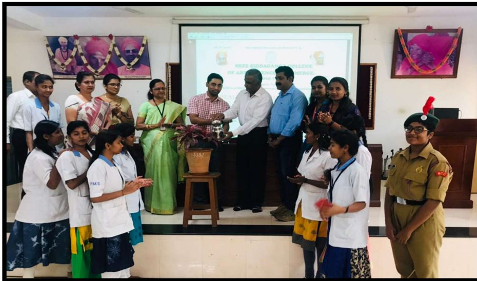
Inauguration of second health camps on 31-07-2019.