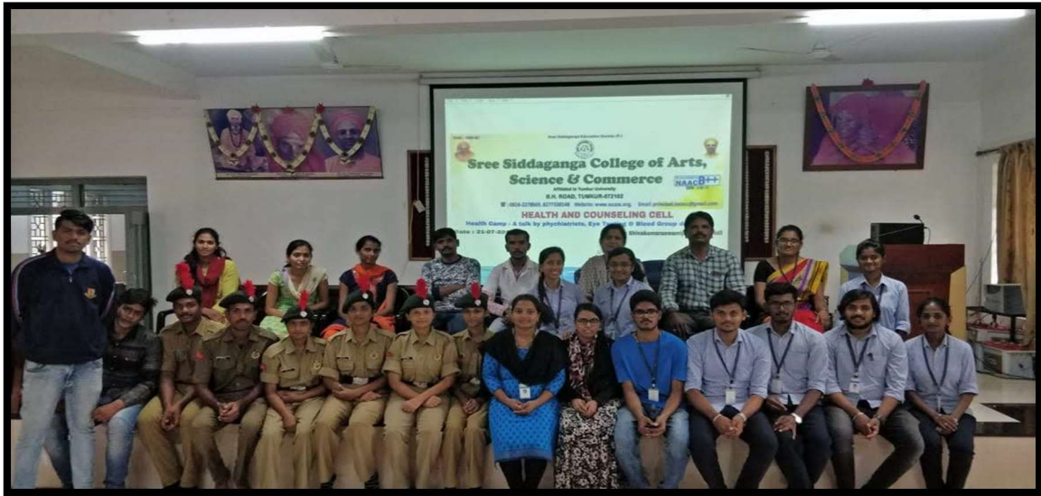
All volunteers of health camp 1