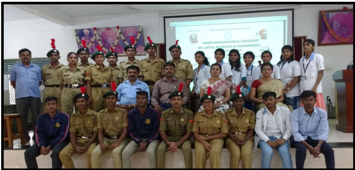
All volunteers of health camp 2