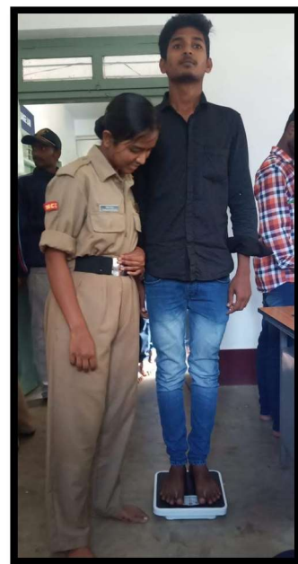
Volunteers of health camp recording height, weight and chest of students.