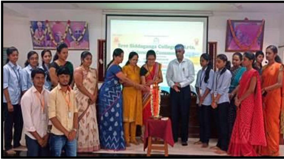
Inauguration of first health camps on 05-02-2020