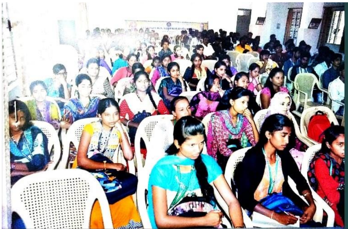
Students assembled in the occasion of forum activity.(2018-19)