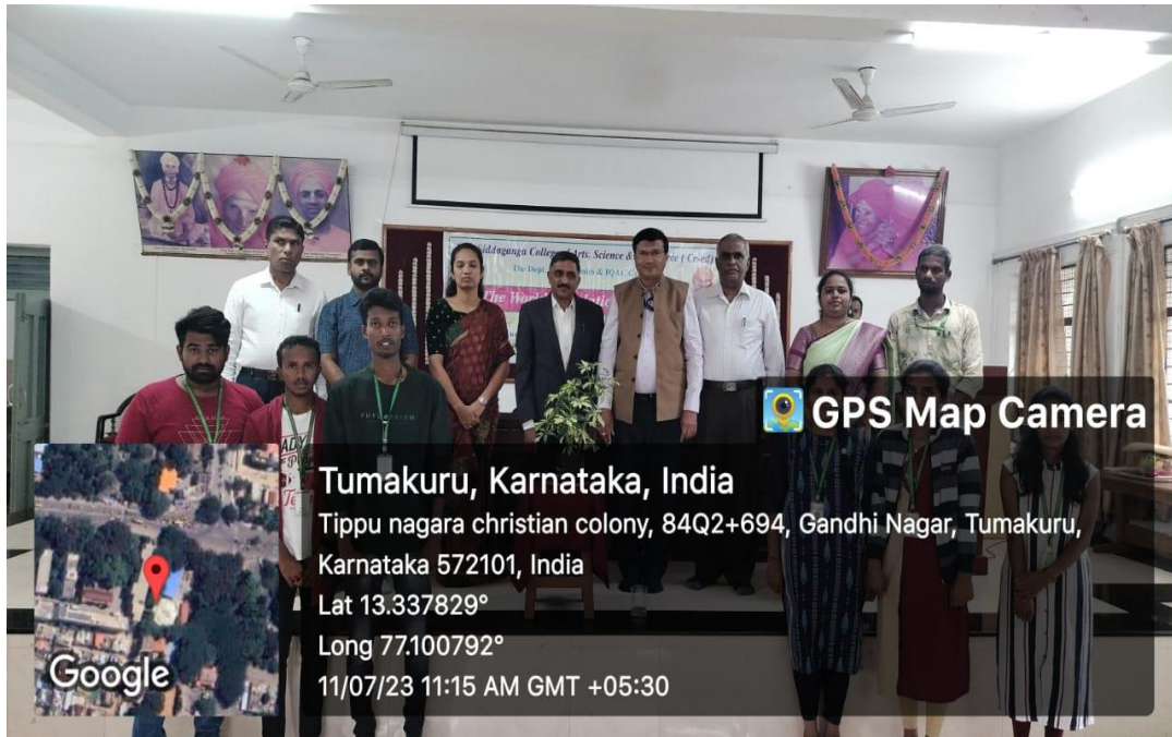
On the occasion of Celebration of World Population Day- 2023 by Dept. Economics dated on 11July23