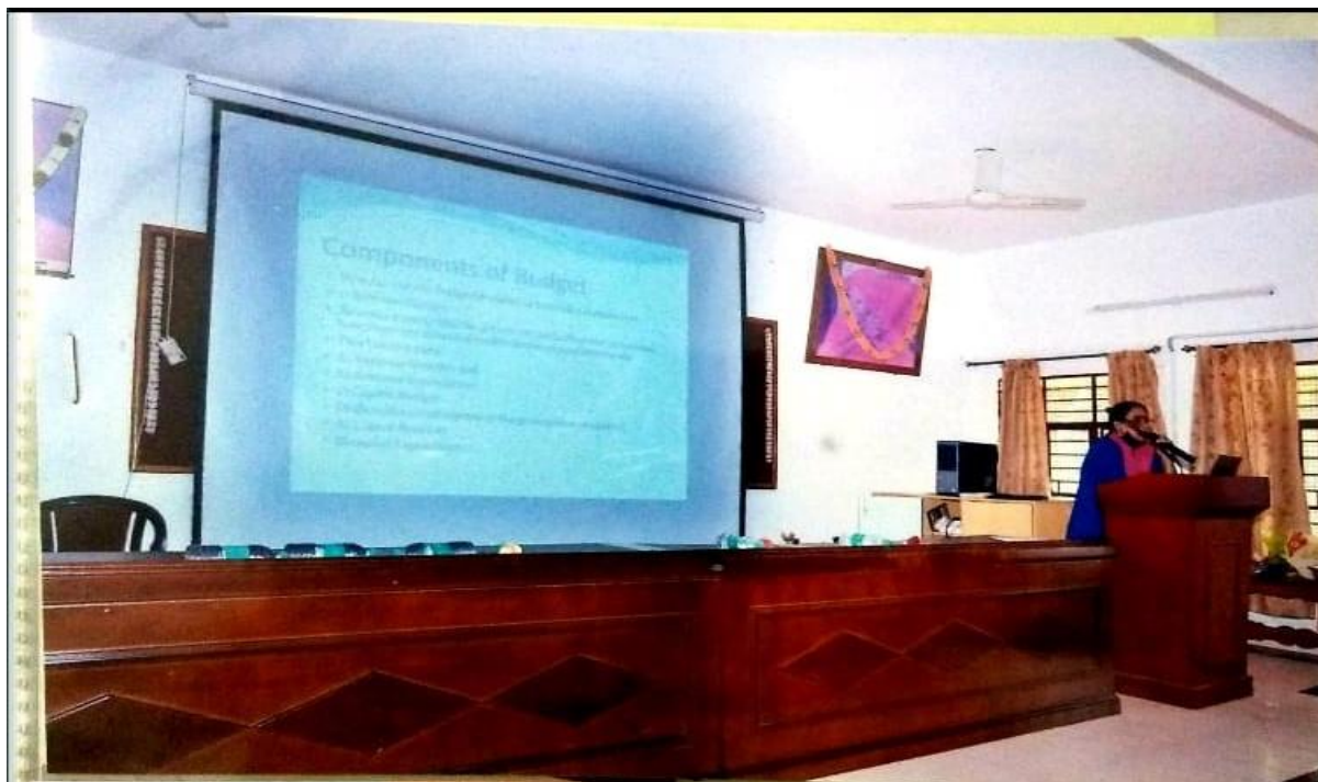
On the occasion of Annual seminar -2021