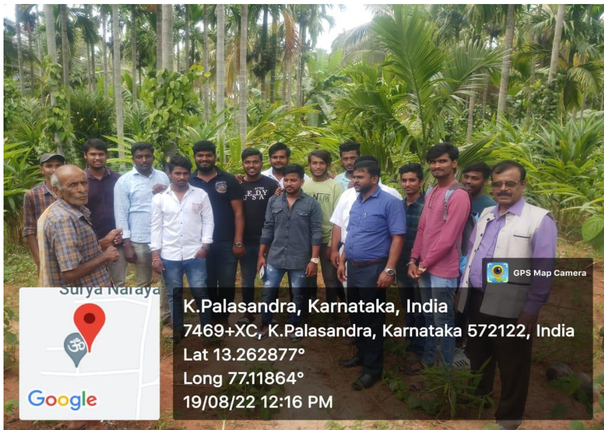
Agriculture field visit to K Palasdandra from Dept. of Economics