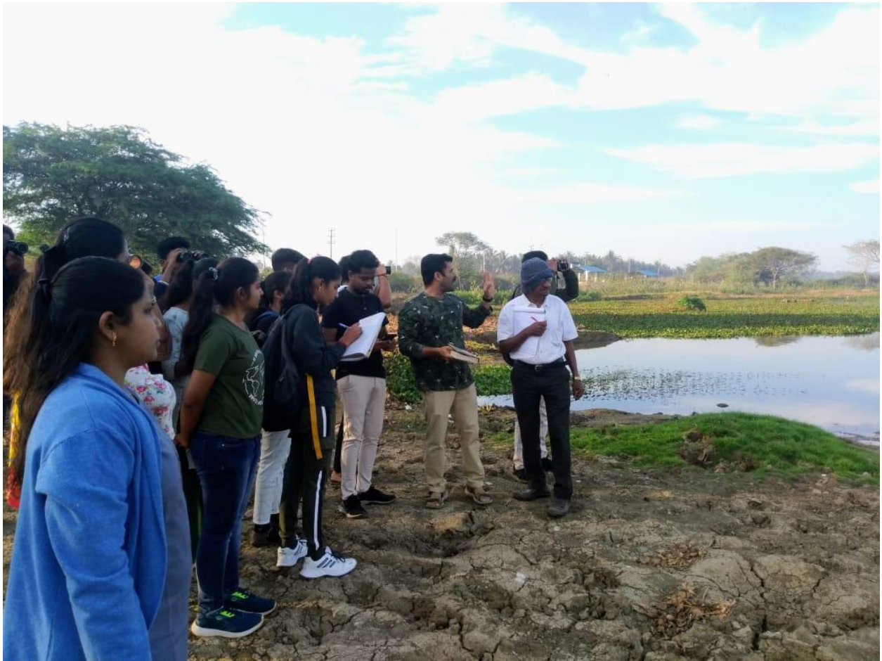
Bird watching in progress in Bheemasandra lake area.

explained the different birds seen that morning in and around the lake area. We were able to identify fortyeight varieties of birds and learnt about their habits and habitats.