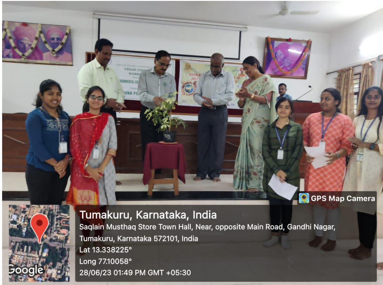
Inauguration of "Eat Healthy-Go Green " Program.