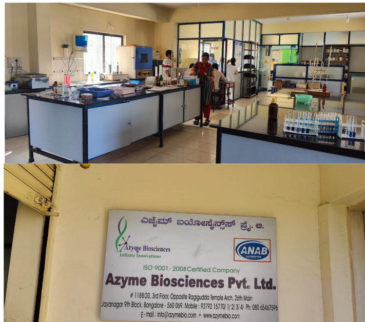
1.Project Training Activity with Azyme Bioscience, Bangalore