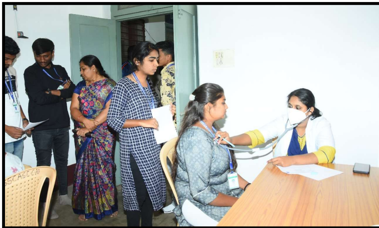
4.MoU with District Hospital for free Health Checkup of students