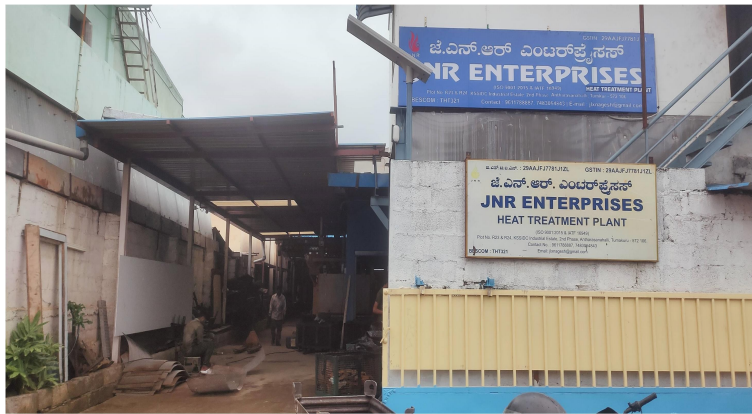
3.Job Training Program with JNR Enterprise,Tumkur