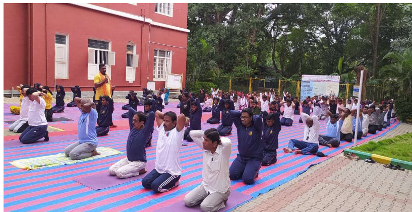
11. Sri Panthanjali Yoga Shikshana Samaste:- Yoga Training Camp