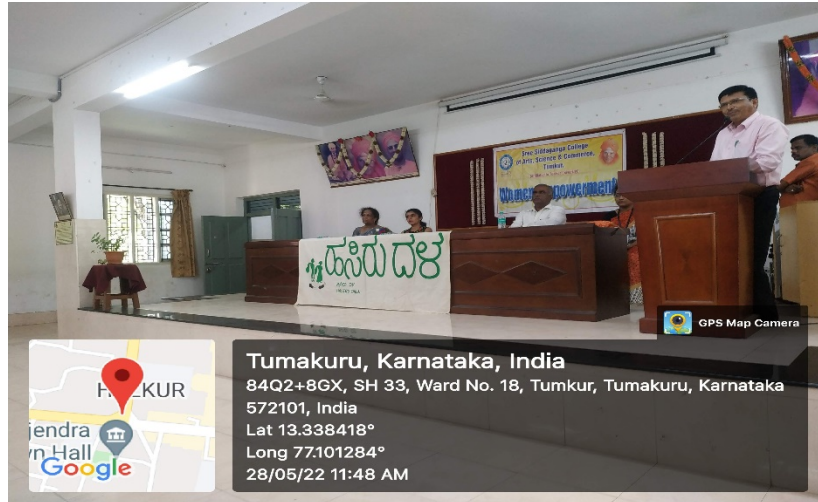
10. Hasiru dala :- Training Program for waste management for our students