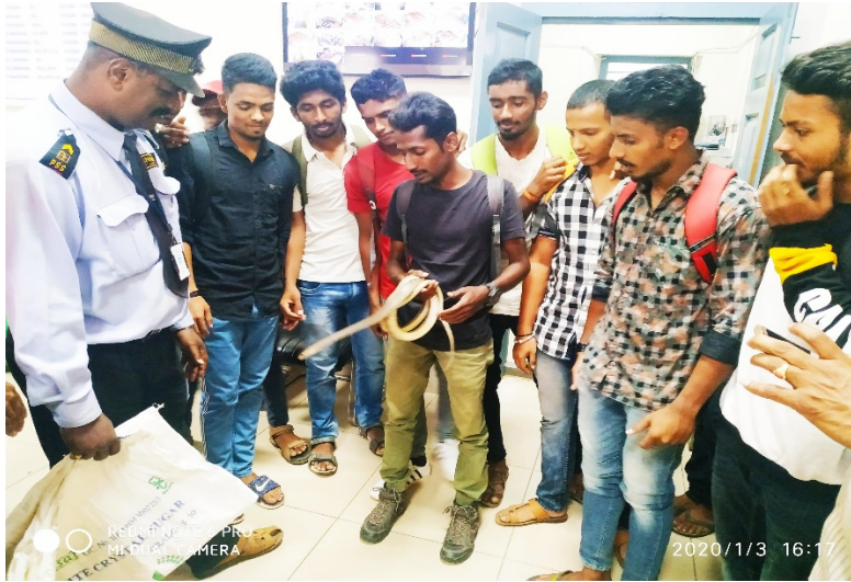
8. WARCO-Rescue operation of Snakes