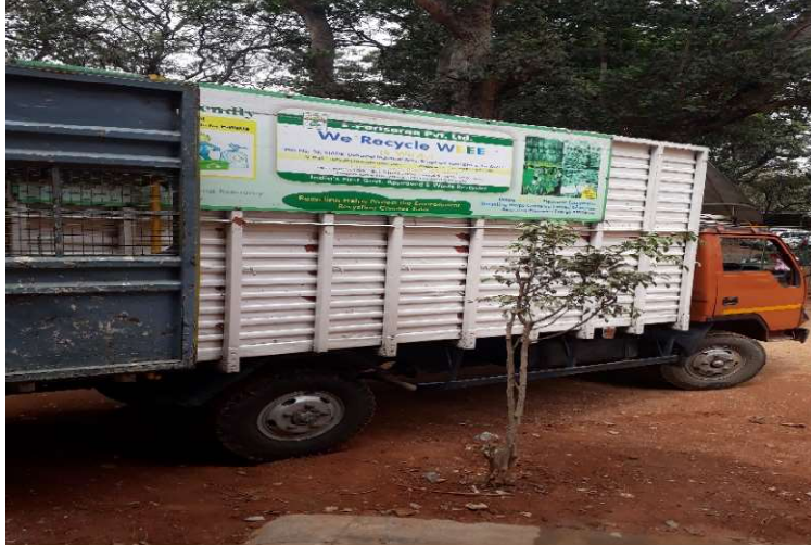
2.Collaboration Activities with E-Parisara for e waste disposal