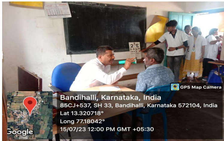
6. Adoption of Village-MoU With Aiyyanapalya Village