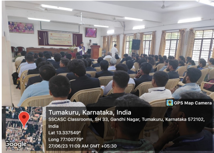
5. DALHAM Learning-Job Training Program