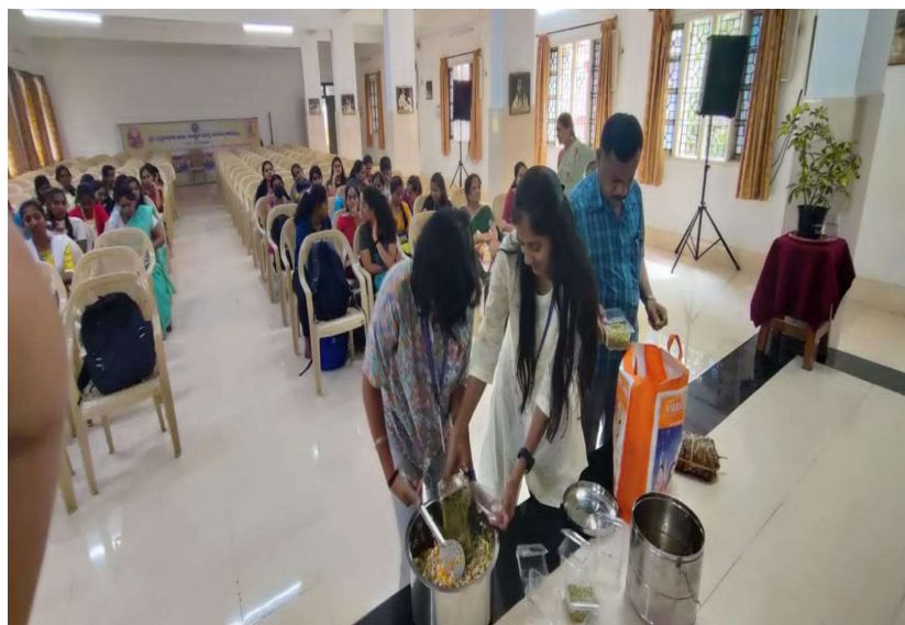
12. c.p.r. environmental education center:- use of Millets in the daily life of girls