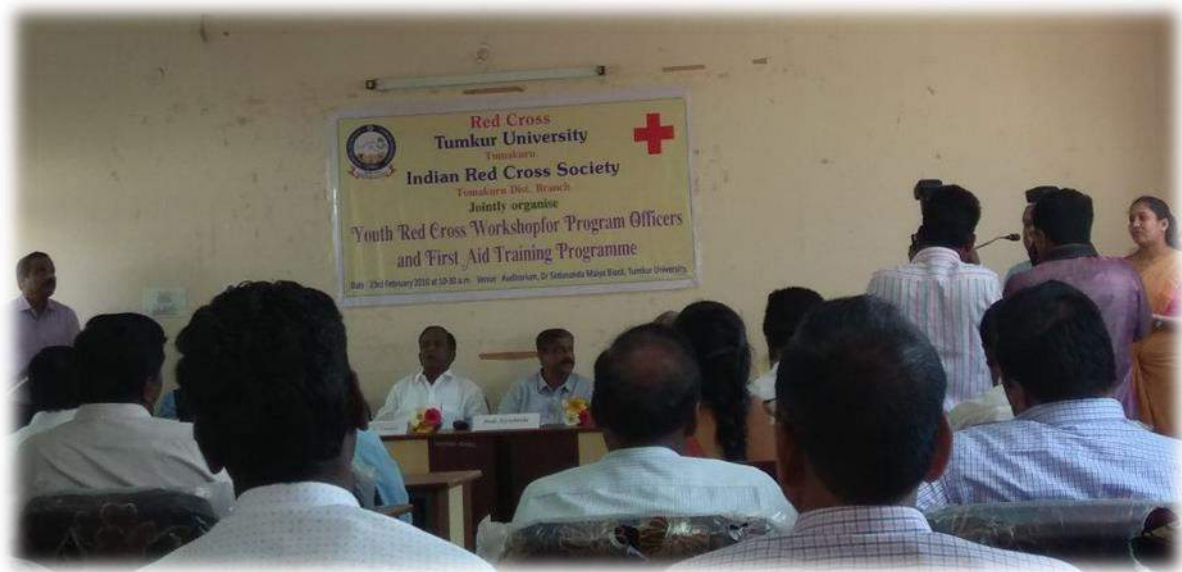
Workshop in Tumkur University for all Red Cross programming officers with collaboration of Tumkur Red Cross society