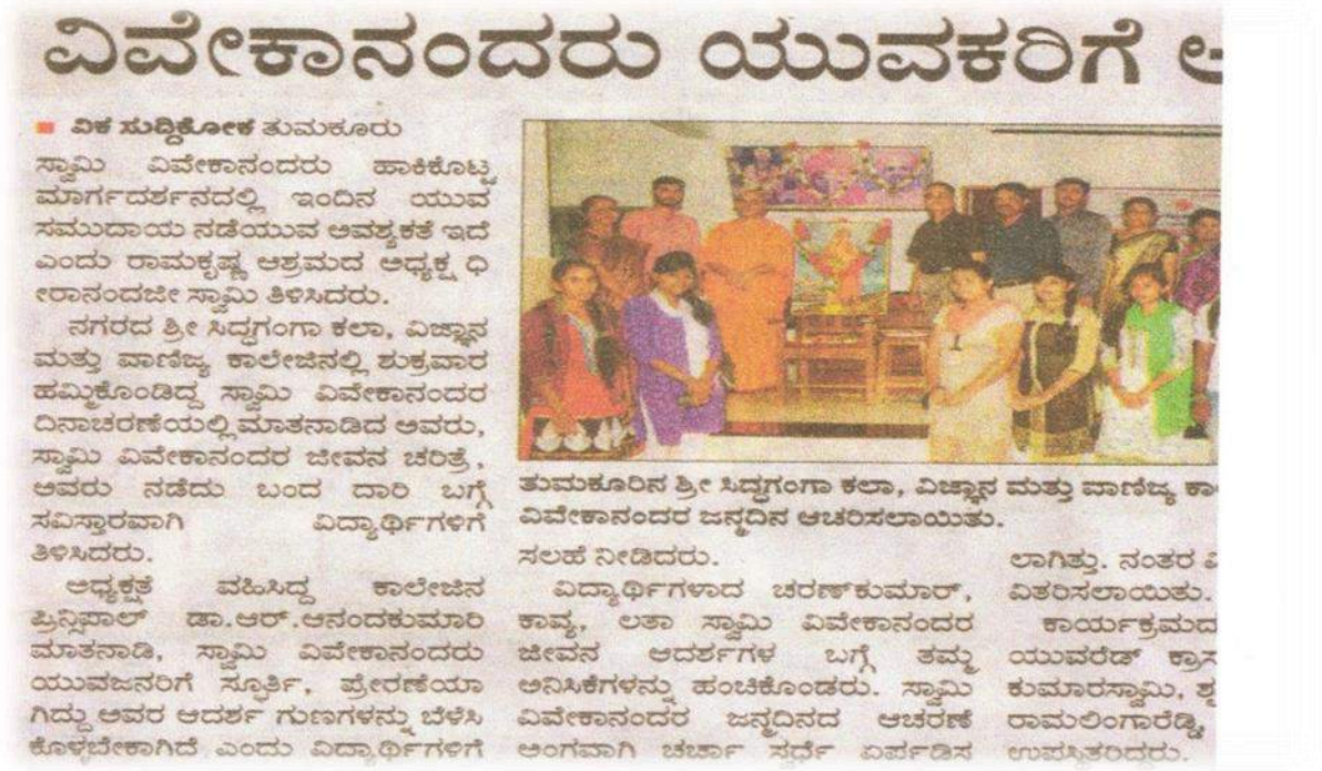
Paper cutting of news report of Youth Day Celebration in local paper Prajavani on 13-01-2018